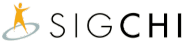
Figure 1. Use high-resolution images, 300+ dpi, legible if printed in color or black-and-white. Number all figures and include captions below, using Insert, Caption.

On pages beyond the first, start at the top of the page and continue in double-column format. The two columns on the last page should be of approximately equal length.